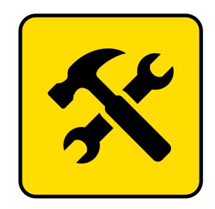
Disturbed during renovation or repairs