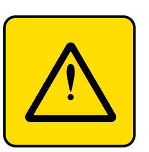
Loose fill asbestos insulation