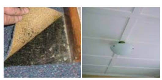
3.) Internal areas wall and ceiling panels, carpet underlay, textured paints, insulation in domestic heaters