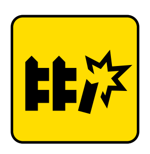
Broken or in poor condition