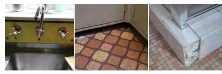
2.) Wet areas - bathroom, laundry and kitchen wall and ceiling panels, vinyl floor tiles, backing for wall tiles and splashbacks, hot water pipe insulation